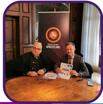
Nenad Lalović, UWW President